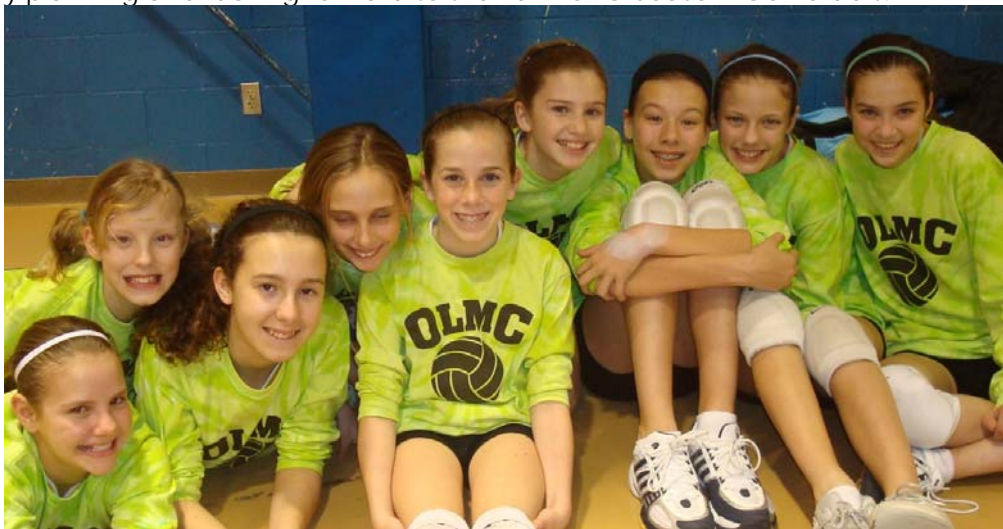
6 th Grade Blue Team waiting to get on the court and take care of business

We are already planning and looking forward to the 2011 CYO Season. Go Raiders!